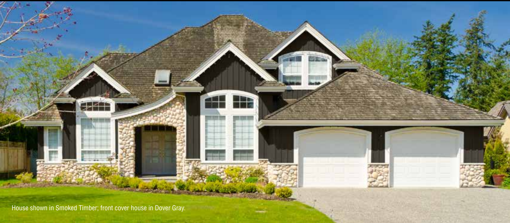
House shown in Smoked Timber; front cover house in Dover Gray.

Board & Batten takes the lead in design versatility. Featuring an authentically proportioned 7" exposure with a 5-1/2" board and 1-1/2" batten strip, this quality-crafted panel works well as a whole-house exterior or as the perfect accent siding.