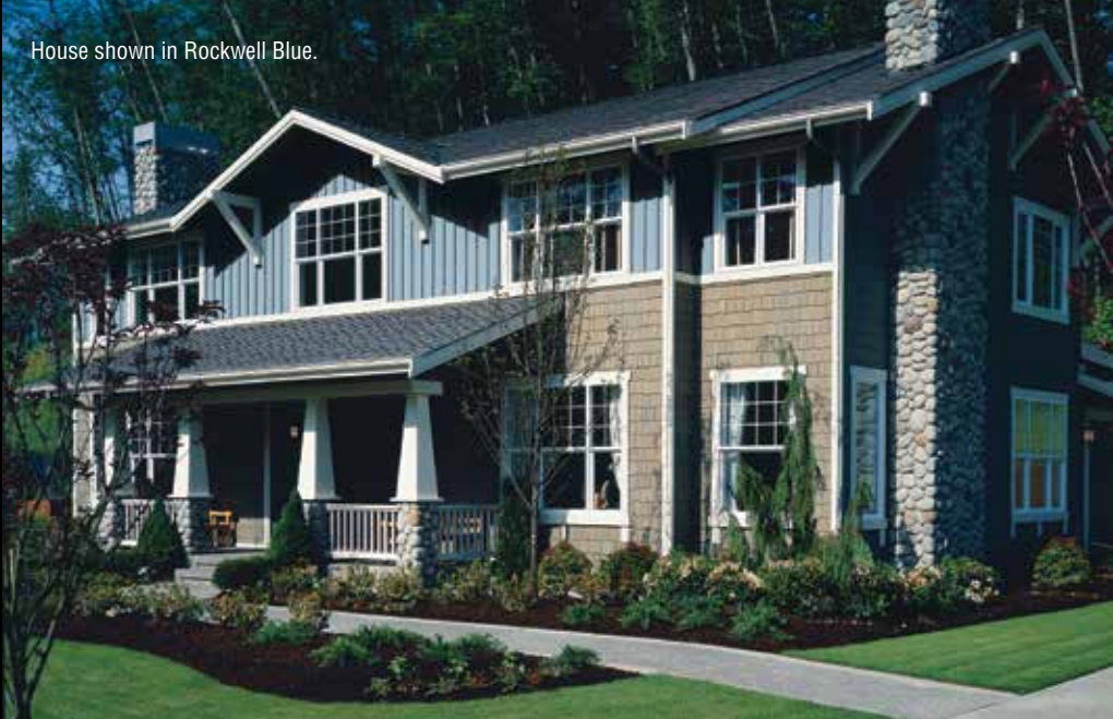
House shown in Rockwell Blue.

It's luxury mixed with livability – it's style-defining and ever strong.