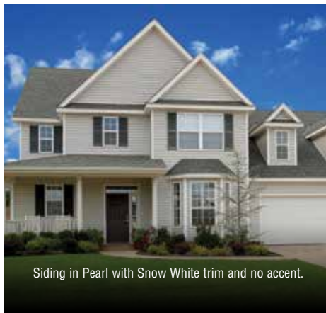
Siding in Pearl with Snow White trim and no accent.