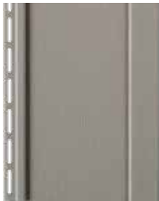
7" Vertical Board & Batten